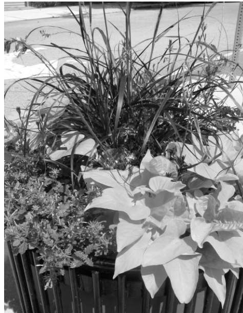
MGC 4-Season Containers Located at Millis Public Library; VMB @ 109 Entrance; Millis Police/Fire Department; DPW @ Water St. and Exchange St./Rt.109 at Niagara Hall.