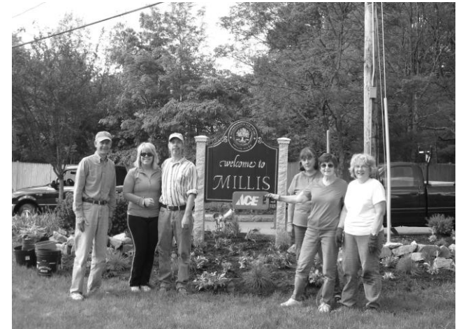
Welcome to Millis Traffic Island, Route 109/Village St., Millis, MA, Spring 2009.

*Welcome to Millis Island Rt. 109/Village St. completed Spring 2009 Multi-season drought resistant perennials and shrubs added to highlight this entry into Millis